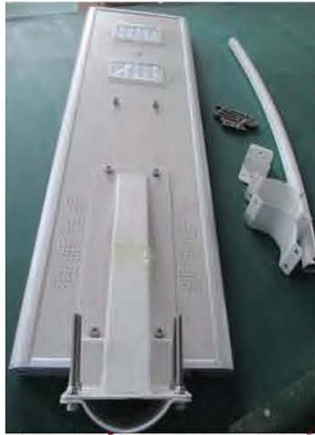
Step 1: Open the box and prepare all the parts you need.