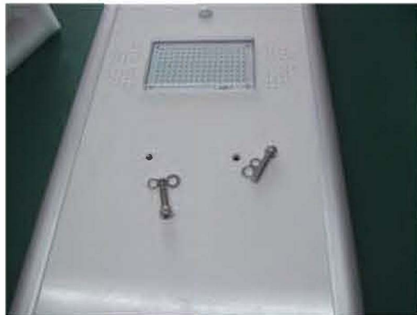
Step 2: Unscrewing the screw of the light fixture/box for installing bracket.