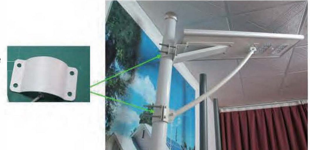
Step 6: Mount the light fixture/box on the pole.