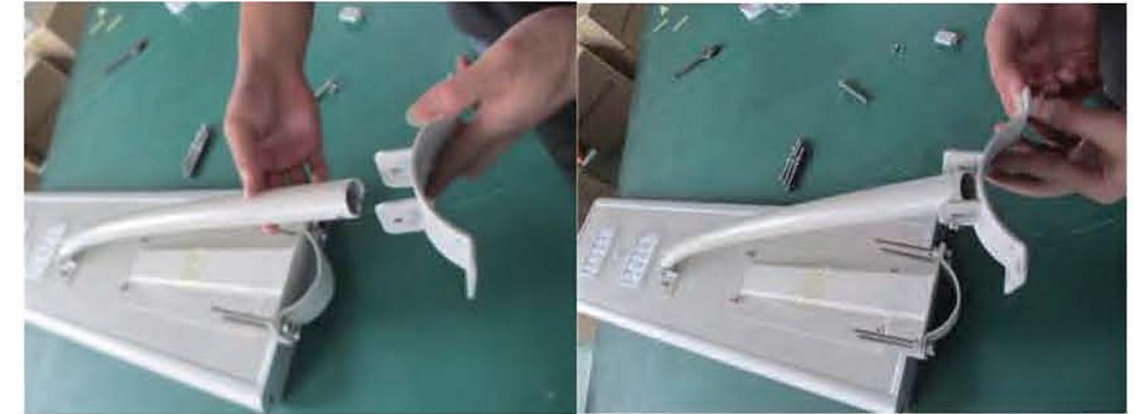
Step 4: Connect the pole mount bracket with the support tube.